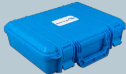
Carry Case for Blue Smart IP65 Chargers and accessories