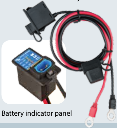
Battery indicator panel